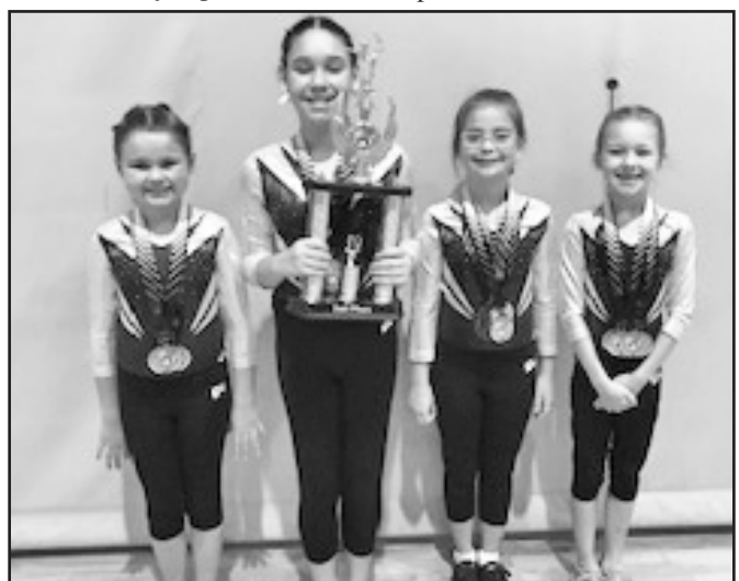
MGC's AAU Level 1 gymnasts