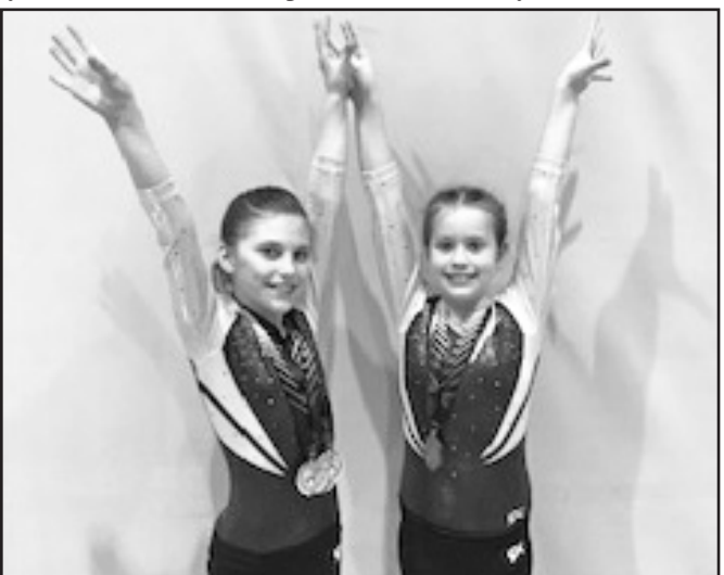
MGC's AAU Silver gymnasts